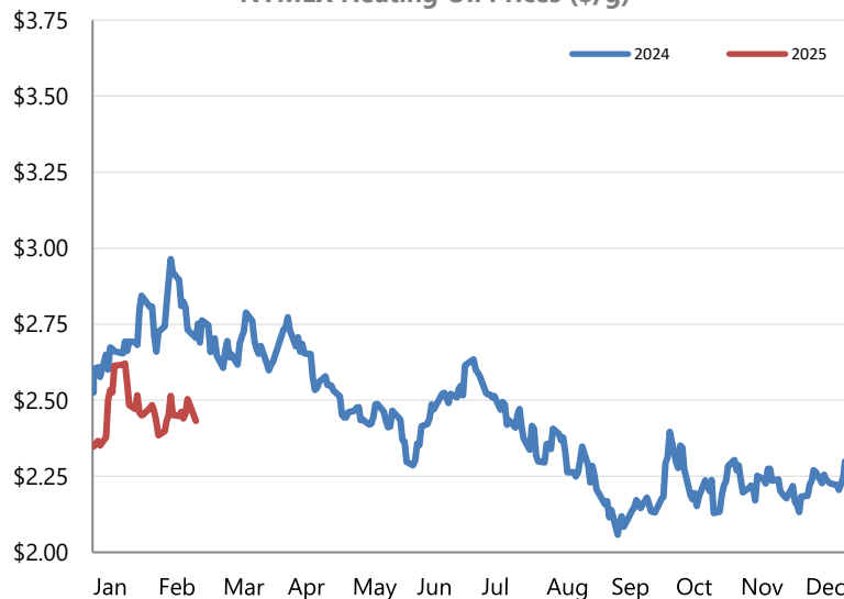
NYMEX Heating Oil Prices ($/g)